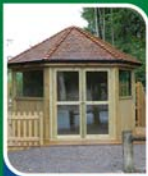
Sheds & Buildings