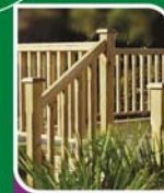
Decking & Landscaping

Open 7 days. Brockley Combe, Backwell, Bristol BS48 3DF